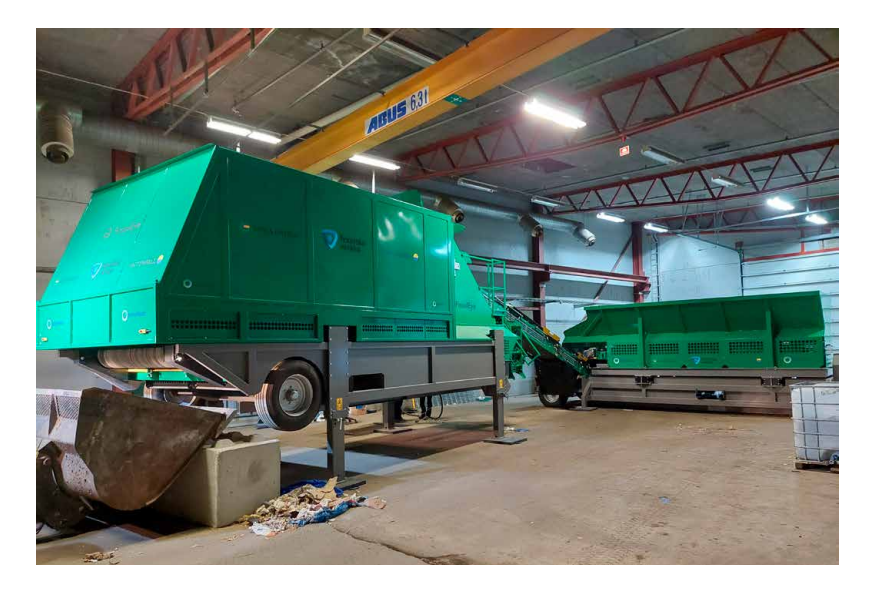
The first edition of FossilEye is mobile. High tech cameras detect plastics in the batch.

The other project is to develop a plastic scanner, called FossilEye. A consortium formed by Tekniska verken, Umeå Energi and Vattenfall Värme procured FossilEye as a pilot plant from RoboWaste in 2022, with support from Avfall Sverige. The pilot scanner is mobile, so all three companies could test and evaluate it.