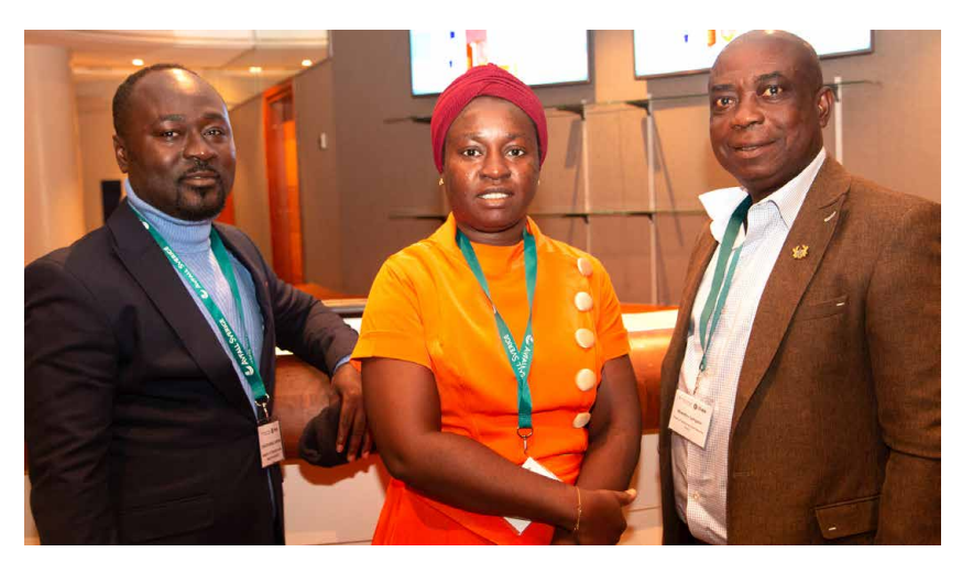
22 countries were represented at the conference, among them a delegation from Ghana.