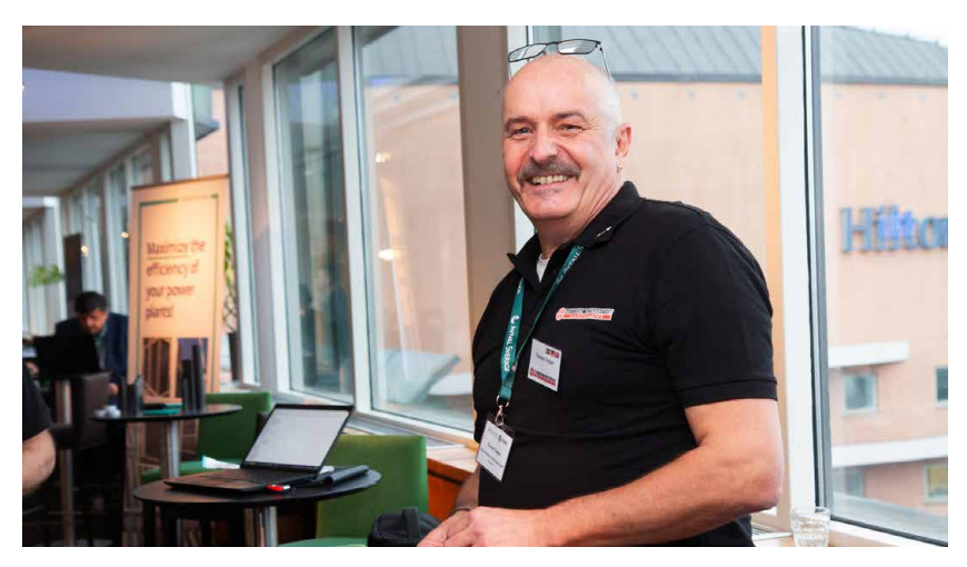
Exhibitors presented their solutions for a more efficient and environmentally customized Waste to Energy.