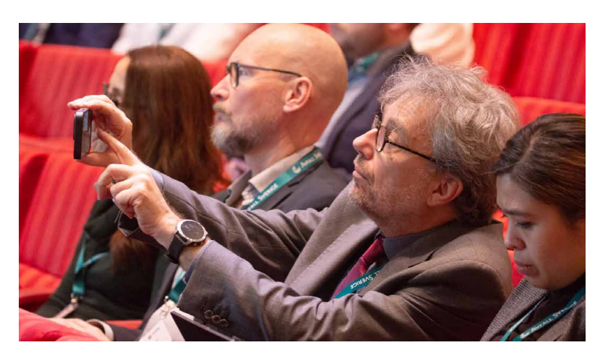
About 150 people gathered at the Iswa Waste-to-Energy Conference in Stockholm in November 2024 to listen, learn and share experiences.

Not as high as I wish it would be. In some countries, like Sweden, Waste-to-Energy is well accepted. In some countries which are not so familiar with it, it's less accepted. It's up to us to communicate, to take people to the plants, to show them how their residual waste is treated. Waste is not something you can just handle that easily; it needs knowledge to deal with it properly in an environmentally sound way. We also need to communicate and inform people about what waste to energy is making, always emphasizing that it does not compete with recycling. It's complementary to recycling.